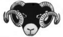
Glaisdale Primary School

Glaisdale school currently has 26 pupils on roll across two classes: Explorers (EYFS/KS1) and Adventurers (KS2). We have a relatively new staff team who have worked hard in recent months to develop our curriculum, sports offer, school council and EYFS provision.